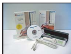
Scale-Link USB - Computer - Input Plan Scaler