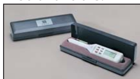
Hard Plastic Protective Case - Protect your investment