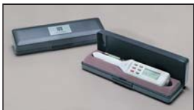
Hard Plastic Protective Case - Protect your investment